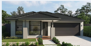
Contemporary Double Garage