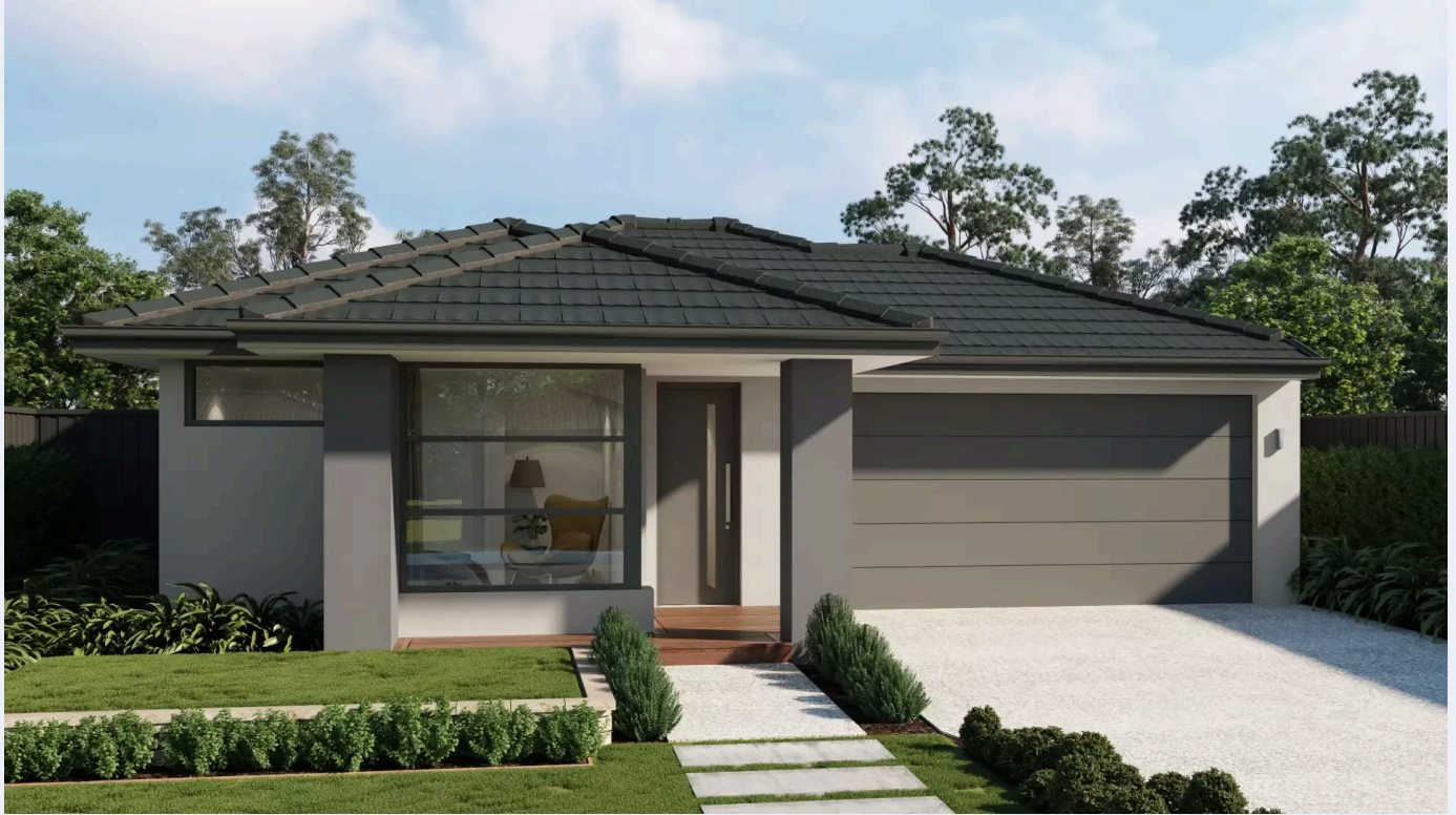
Modern Double Garage