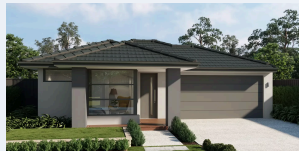
Modern Double Garage